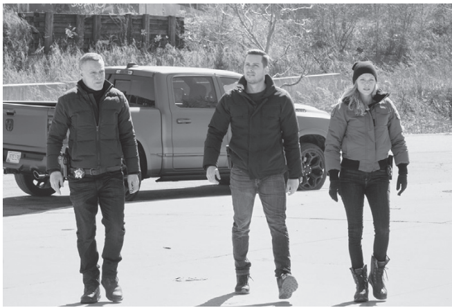
Jason Beghe as Sgt. Hank Voight, Jesse Lee Soffer as Det. Jay Halstead and Tracy Spiridakos as Det. Hailey Upton on NBC's "Chicago P.D."

•Visit www.wnypapers.com to read our interviews with the "Chicago" stars.