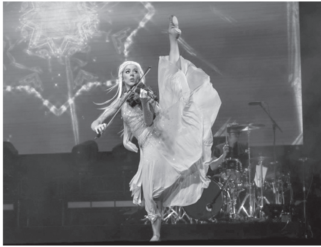
Lindsey Stirling